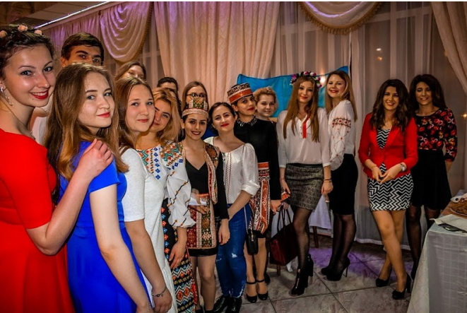
Erasmus+ students take part in a Global Village Event