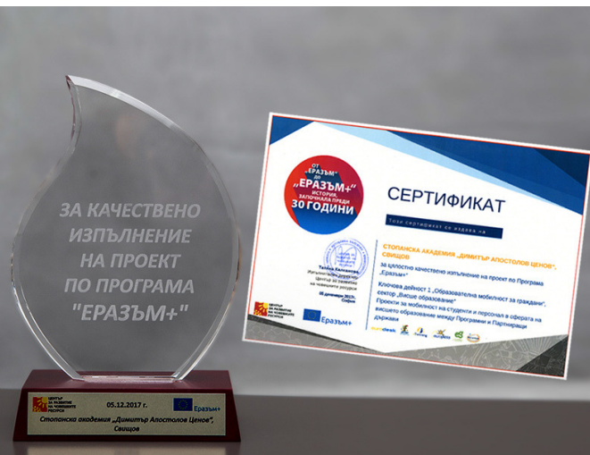
Certificate for a high quality implementation of Erasmus+ project under KA107